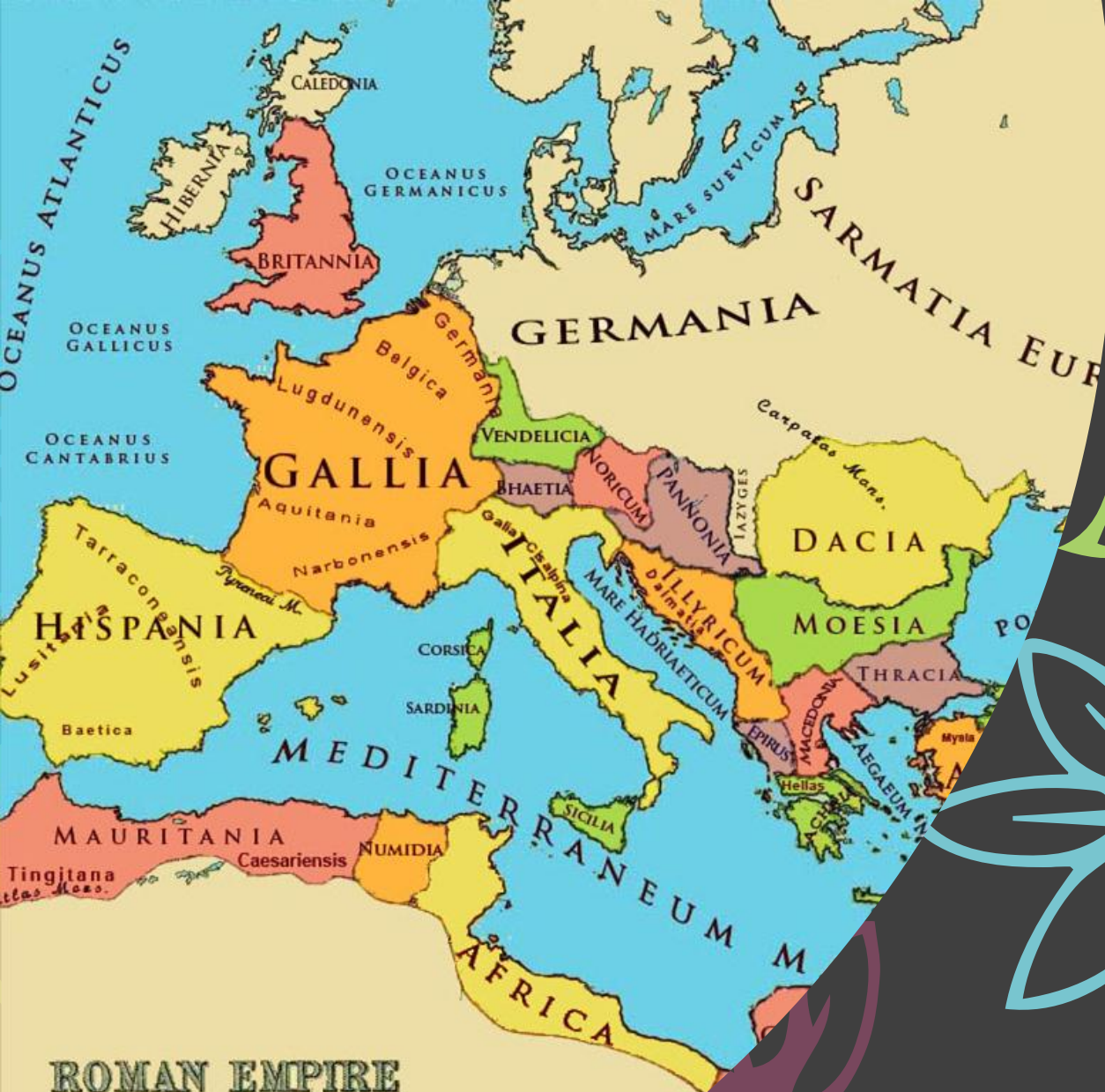
ROMAN EMPIRE AT ITS GREATEST EXTENT