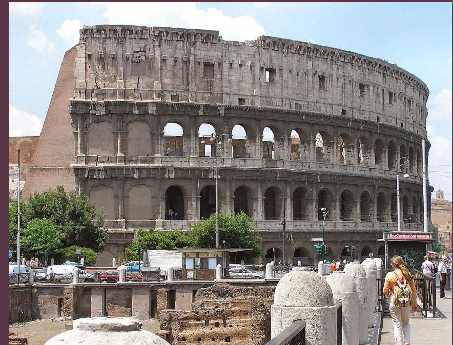
The Colosseum in Rome